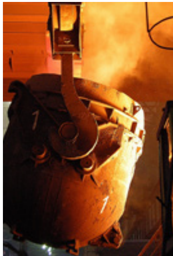
冶金行业 Metallurgical Industry