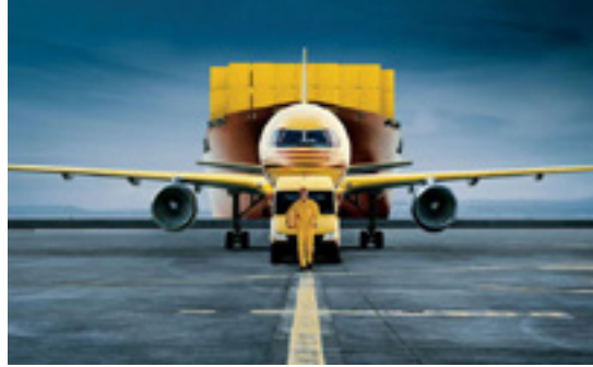
物流、港口机械 Logistics, port machinery